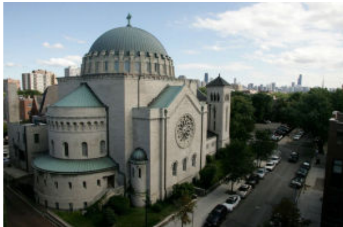
St. Clement Church, one of the destinations in Lincoln Park.

*times may vary by site, check site listing for details.